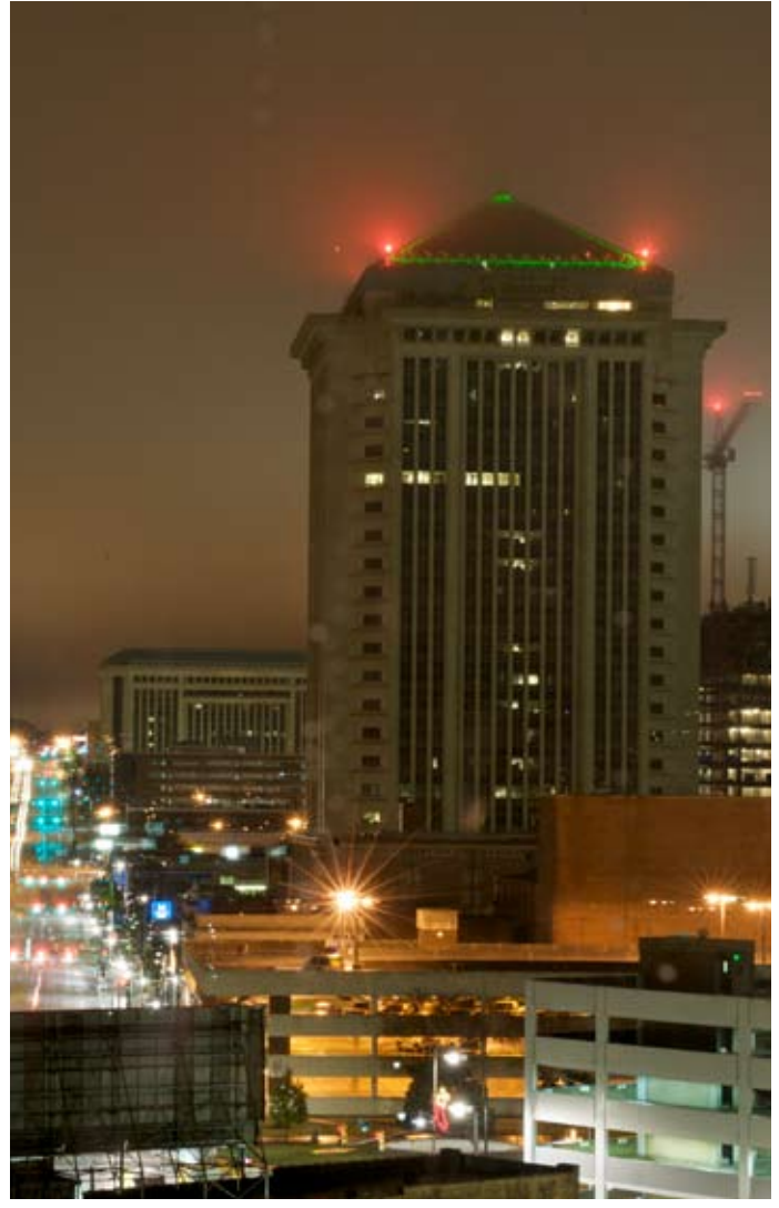
The Retirement Systems of Alabama (RSA) was an early partner in Montgomery's downtown revitalization efforts.