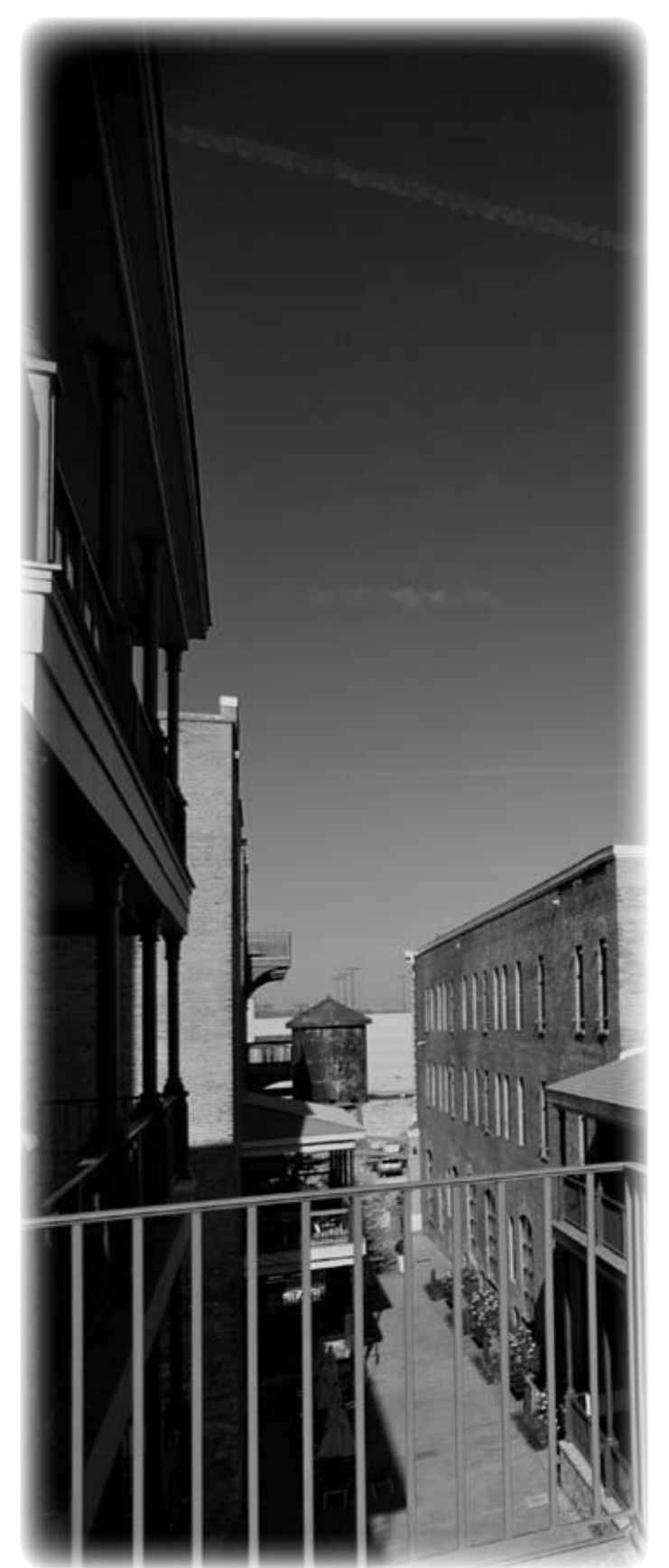
Originally comprised of warehouses, loading docks and storage buildings, The Alley has been transformed to include free-flowing open air spaces with comfortable patios overlooked by New Orleans-style balconies.