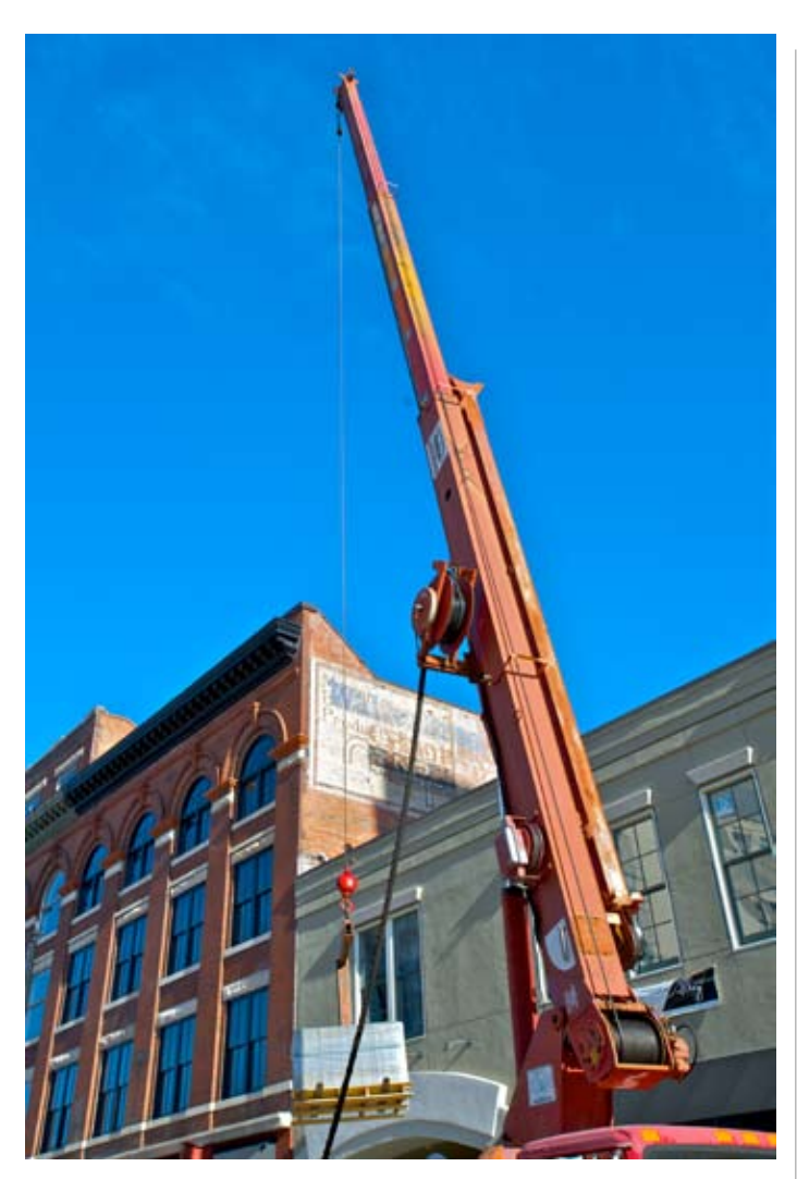
A construction crane lifts a pallet of tiles to the roof of a building located on the Commerce Street side of The Alley in downtown Montgomery.