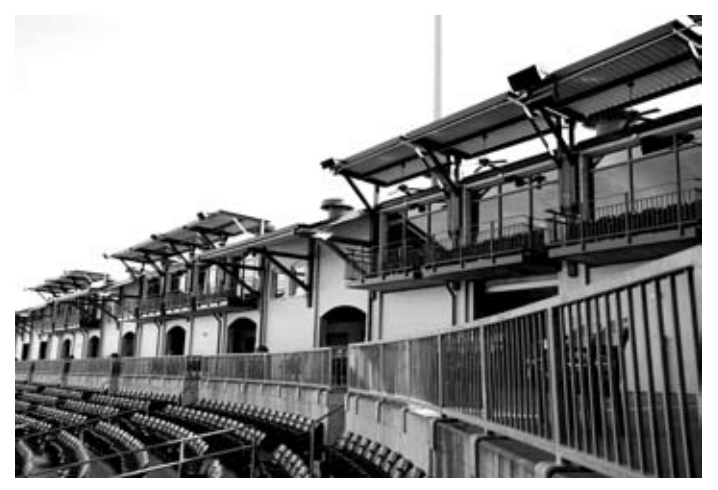
Riverwalk Stadium, home to the Montgomery Biscuits

After much public back and forth between the City and the ARB, the tower will remain in its new location and will eventually feature specialty colored lighting and distinctive signage marking the entrance to this unique downtown destination. In addition to common areas and right-of-ways, Montgomery has also ramped up pedestrian lighting and created the River District Police Precinct, which focuses on the downtown area. The River District Substation will be located in the core of The Alley and will be equipped with surveillance equipment to monitor the common areas.