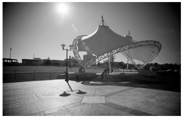
Montgomery's Riverwalk Amphitheater